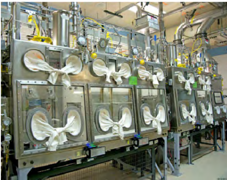
Figure 5. Gloveboxes installed at the Plutonium Facility at Los Alamos National Laboratory.

In leading reviews of projects at multiple DOE sites, NA-90.2 is uniquely positioned to develop meaningful lessons learned. As an example, there are currently four NNSA projects that are designing and installing gloveboxes as safety systems (see Figure 5): the Uranium Processing Facility at Y-12 National Security Complex, the Los Alamos Plutonium Pit Production Project at Los Alamos National Laboratory, and SRPPF and the Surplus Plutonium Disposition projects at Savannah River Site. NA-90.2 conducts reviews for each of these projects. The lessons learned that NA-90.2 collects and enters into the DOE lessons learned system of record could help improve information exchange between these projects.