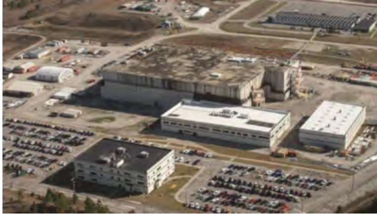
Figure 2. An aerial view of the SRPPF project at the Savannah River Site, which was delayed due to the need for upgrading controls to safety significant in preliminary design.