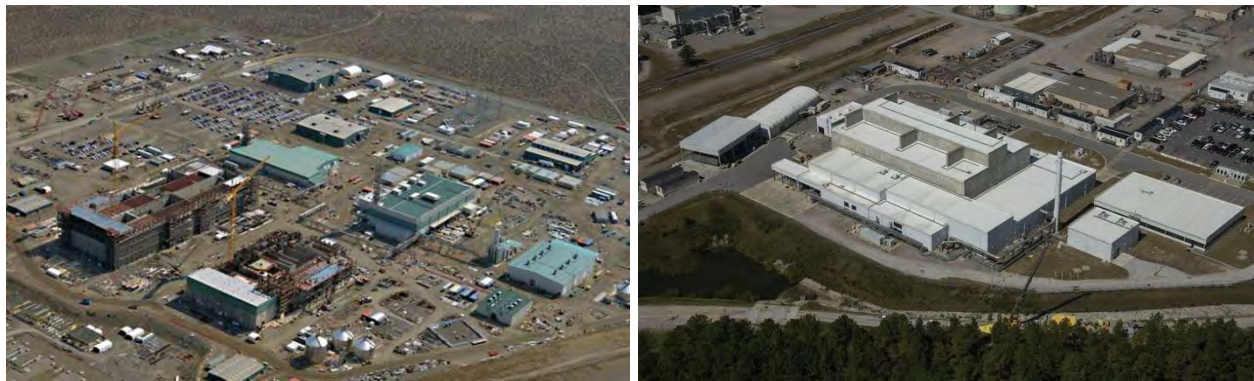
Figures 3 and 4. Aerial views of the Waste Treatment and Immobilization Plant (left) at the Hanford Site and the Salt Waste Processing Facility (right) at the Savannah River Site, which were delayed due to nuclear safety issues.

Following the IPR, NNSA's Savannah River Acquisition and Project Management Office and NNSA's Savannah River Site Field Office dismissed DOE-EA's safety concerns in a joint letter [5]. NNSA's Office of Environment, Safety, and Health [6] [7] [8], the Board [9] [10] [11], and DOE's Office of Environment, Health, Safety and Security [12] subsequently all raised related concerns with facility worker safety. As a result, SRPPF project personnel upgraded a series of controls to safety significant, which included more than 100 local alarms; more than 200 gloveboxes, hoods, and sections of material transfer system trunklines; and the building fire suppression system [13] [14]. These changes delayed the project. There is no guarantee that this outcome could have been avoided if the 2021 IPR team completed its own assessment of the adequacy of facility worker protection or made its comment into a recommendation, but at a minimum, it would have forced additional review and increased visibility of a highly important safety topic at a key juncture in the design.