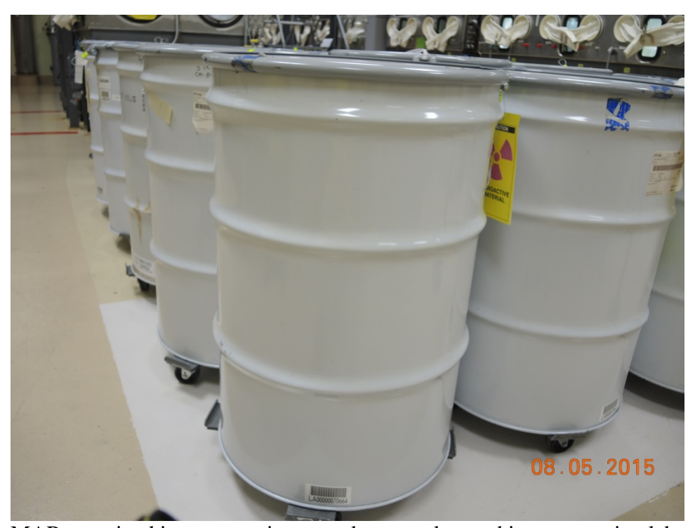
Figure 6: MAR contained in transuranic waste drums and staged in an operating laboratory.

The Accelerated Vault Work-off project under the Material Recycle and Recovery program aims to recycle, recover, repackage, or dispose of 2.5 MT of nuclear materials from the facility, including about 700 kg destined to leave PF-4, most as transuranic waste [5]. More broadly, this effort addresses much of the materials present that are categorized as No Defined Use<sup>1</sup>, which total roughly 40 percent by mass of the plutonium inventory (excluding Pu-238) at PF-4 [6]. This important initiative will free up storage space and greatly improve safety and efficiency for vault users. Unfortunately, this initiative's progress has been hindered by resource conflicts associated with the ongoing PF-4 restart effort and issues at the various LANL facilities that manage transuranic waste. For example, PF-4 operations are nearing the point of curtailing waste generating activities because local waste staging areas are approaching their capacity and Area G remains unable to receive newly-generated waste due to a number of significant safety basis issues (Figure 6).