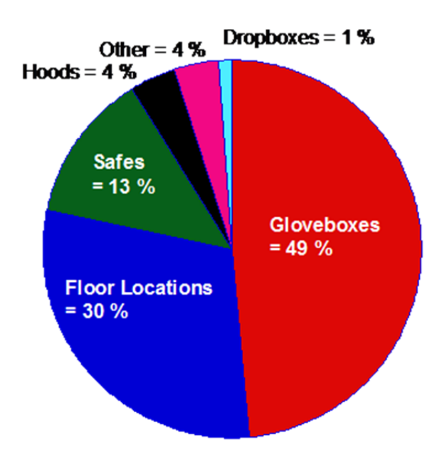
Figure 3: Distribution of MAR by location type on the first floor of PF-4.

Gloveboxes and floor locations are the most vulnerable to impacts from seismic events and fires, yet these locations hold nearly 80 percent of the MAR (Figure 3). For example, floor