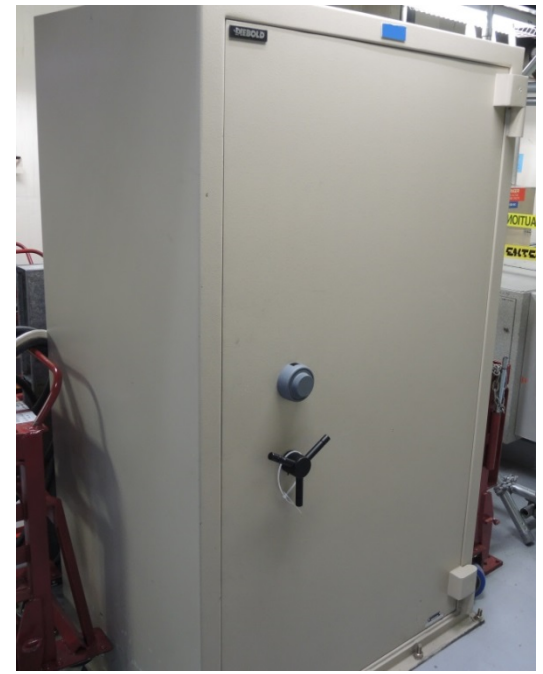
Figure 5: This safe offering improved protection for MAR is unused.

PF-4 contains about 50 safes of various sizes and designs that offer improved protection for MAR, including many that the approved safety basis identifies as eligible to use reduced damage ratios in accident consequence calculations. Unfortunately, in most cases the use of safes is impeded by incomplete nuclear criticality safety evaluations, and incomplete seismic anchoring and supporting engineering documentation for the safes. Only limited resources are available to perform these tasks, and making safes available for storage has not been a priority. The Site Representatives' review of inventory information indicates there is ample available capacity. For example, six large, robust safes that were acquired in the past few years could potentially accommodate more than 200 kg of material, but are presently empty (Figure 5).