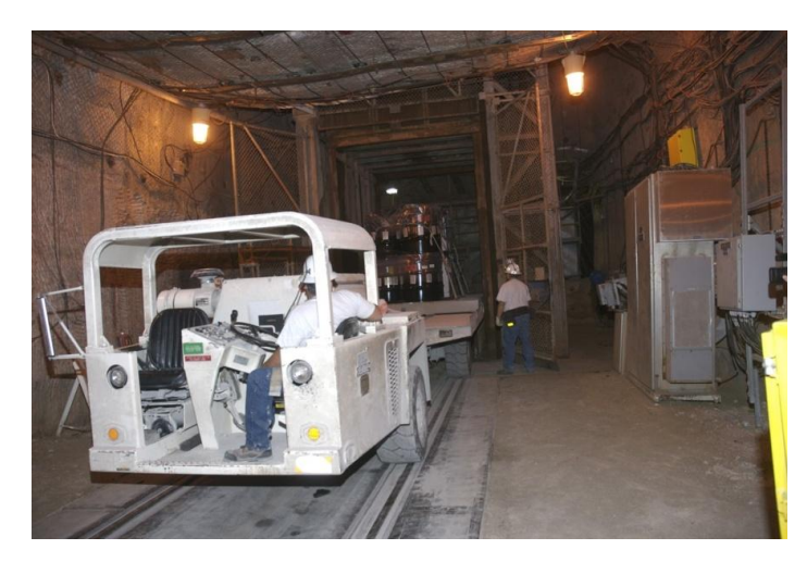
Underground, Waste Isolation Pilot Plant

The Board reviewed transuranic waste remediation operations at DOE's Idaho and Savannah River sites, and transuranic waste disposal at the Waste Isolation Pilot Plant in New Mexico. The Board found procedural compliance issues at Idaho, leading DOE and its contractor to take corrective actions. The Board also evaluated preparations for the retrieval of degraded waste boxes and drums at the Advanced Mixed Waste Treatment Project at Idaho. The Board identified problems