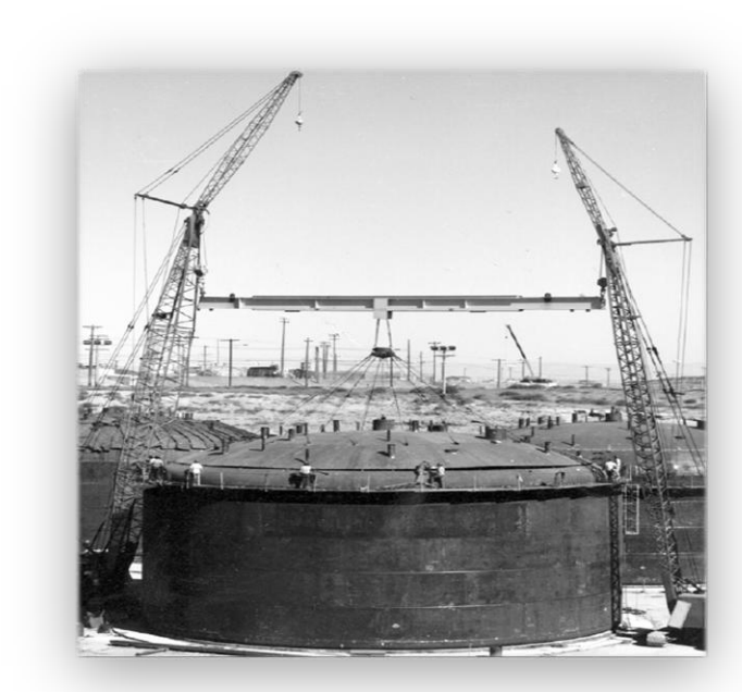
Hanford Tank Farms Under Construction, Circa 1949