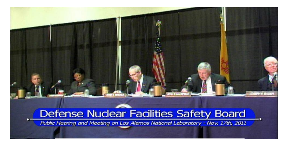
PF-4 Public Hearing, November 2011

safety at PF-4. NNSA and contractor engineers committed to provide information and analyses regarding facility weaknesses that could lead to release of radioactive materials and high risk to the public. The Board continues to work closely with NNSA and contractor personnel on this topic.