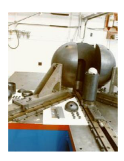
Flat-Top Critical Assembly