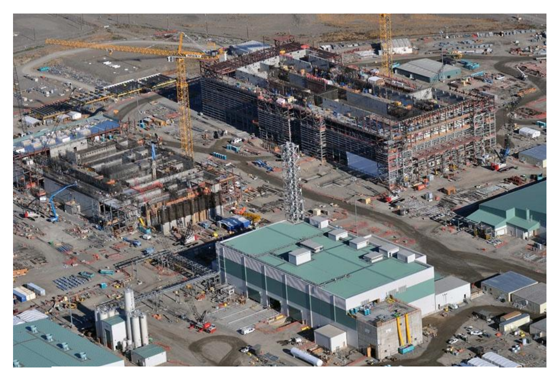
Construction Site, Waste Treatment and Immobilization Plant

eliminate the safety and environmental risks posed by continued storage of this waste in aging underground tanks. Although this is a one-of-a-kind project with novel technology that requires significant research and development, it is being designed concurrent with construction. As a result, timely identification and resolution of technical issues is paramount to meeting the objectives of the Hanford cleanup effort.