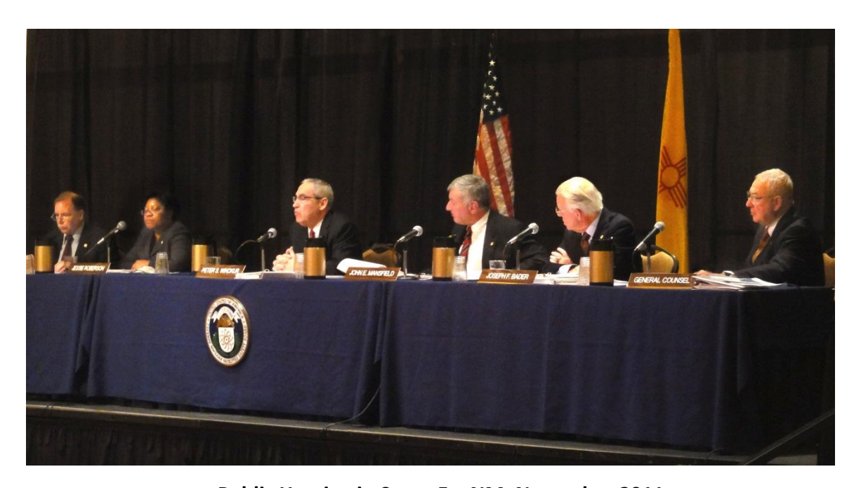
Public Hearing in Santa Fe, NM, November 2011

The Board's enabling legislation vests it with a comprehensive suite of statutory tools to accomplish its oversight mission. Chief among these is the Board's power to hold public hearings. Public hearings are essential to the Board's mission because they assist the Board in obtaining vital safety information from the DOE, NNSA, expert sources, and the public. In 2011, the Board made full and extensive use of this statutory tool, holding three public hearings. The Federal Register notice and agenda for each hearing were posted on the Board's website, and the Board advertised hearings held away from Washington, D.C., in local newspapers. The Board receives testimony from the public at its hearings. Such testimony is included in the public record of the hearing.