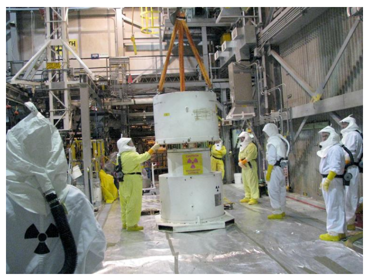
Mock-up of Sludge Container

At the Hanford site, the Board reviewed DOE's plans to restart operations at the Cold Vacuum Drying Facility. This facility will support cleanup of the K West Basin as well as sludge disposition. The Board suggested that DOE reconsider the planned level of rigor for restarting this facility based on how long it has been inactive. DOE now plans to conduct a formal readiness assessment to better ensure the facility is ready to operate safely. In addition, the Board reviewed DOE's conceptual design for systems to remove radioactive sludge from the K West Basin. This review disclosed several design problems that were identified in a letter to DOE dated December 22, 2010. In response, DOE is enhancing safety systems, improving the accident analysis, and developing a new capability to evacuate members of the public from the Columbia River in the event of an accident.