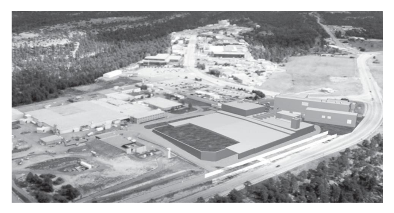
Conceptual Drawing of Chemistry and Metallurgy Research Replacement Facility

environmental impact statement and issued an Amended Record of Decision on October 11, 2011. On October 13, 2011, NNSA directed the project to proceed with final design.