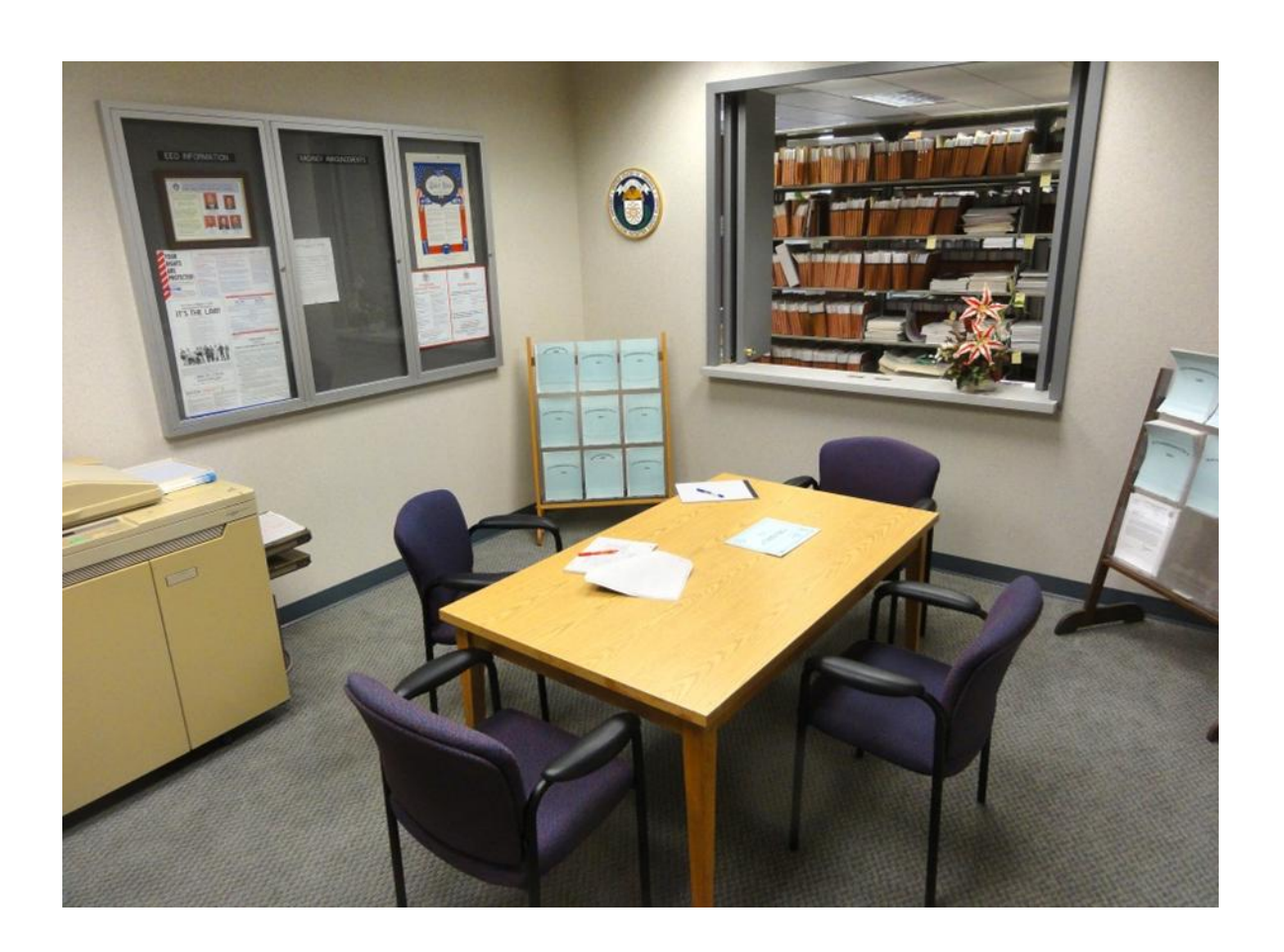
The Board's Public Reading Room

Pursuant to the Board's enabling legislation, all of the Board's recommendations are mailed to DOE's Public Reading Room at DOE's headquarters building, located at 1000 Independence Avenue, SW, Washington, D.C. 20585.