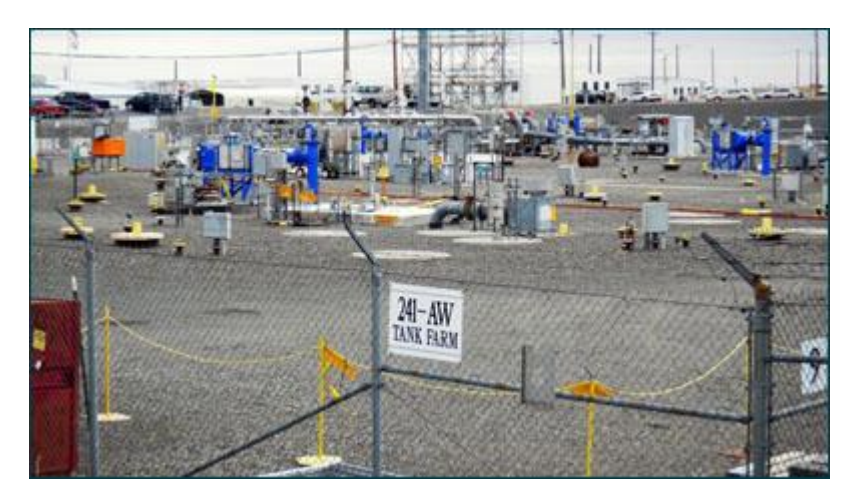
Hanford Double-Shell Tank Farm

action is taken to restore the safety classification of the ventilation systems and identify needed physical improvements.