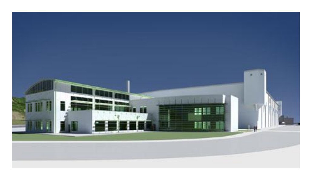
Artist's Concept, Uranium Processing Facility

In late 2010 and early 2011, the Board reviewed the facility's preliminary design, finding that it significantly reduced safety systems from those originally planned. The Board determined that satisfactory justification for this reduction had not been developed. NNSA reached the same conclusion, and in February 2011 directed its contractor to develop a more complete analysis in the form of a full Preliminary Safety Design Report. The Board reviewed this report in the fall of 2011. Once again, the Board identified serious flaws in the analysis. Once again, NNSA agreed and directed the contractor to take corrective actions. At the end of the year, NNSA was evaluating additional actions needed to ensure that the safety control set is adequate.