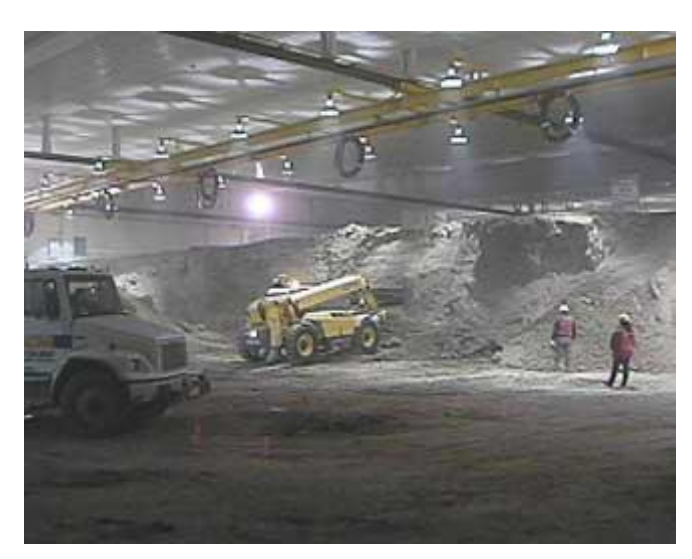
Waste Retrieval at the Advanced Mixed Waste Treatment Project

The Waste Isolation Pilot Plant is the nation's sole facility for permanent disposal of defense-related transuranic