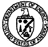
SAMUEL W. BODMAN Secretary of Energy