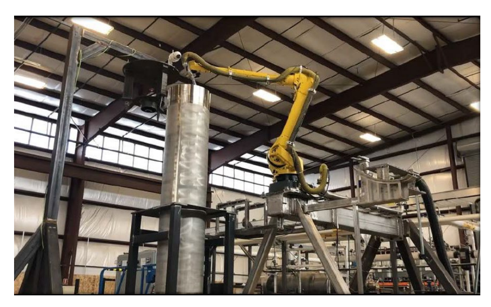
Full-Scale Mock-up of Canister Decontamination Testing

The Integrated Waste Treatment Unit is designed to process approximately 900,000 gallons of liquid radioactive sodium-bearing waste, which is now stored at the Idaho Nuclear Technology and Engineering Center tank farm, as well as newly generated liquid waste from the center. In 2020, Integrated Waste Treatment Unit personnel continued to perform system maintenance and modification work activities. Resequencing of planned field activities was necessary due to COVID-19 pandemic constraints, which significantly delayed the planned start of readiness activities and commencement of radiological operations.