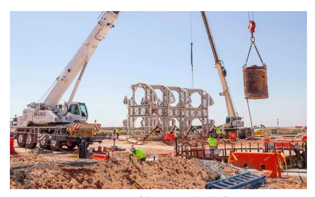
Excavation of the New Utility Shaft

In an August 27, 2019, letter to the Secretary of Energy, the Board outlined three safety issues associated with the Safety Significant Confinement Ventilation System. These issues are related to the time required to return the system to a safe (filtered exhaust air) configuration upon detection of an underground radiological release; the interlocks between supply fans in the proposed utility shaft and the confinement ventilation system fans for avoiding inadvertent up-casting of potentially contaminated underground air; and the use of a regulatory framework established by 10 CFR 835, Occupational Radiation Protection , as opposed to 10 CFR 830, Nuclear Safety Management , to establish performance requirements for the underground continuous air monitors.