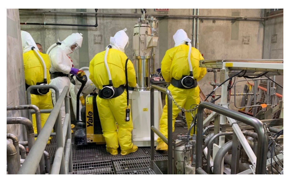
Facility's Personnel Demonstrate Replacing a Contactor Prior to Start-up

The Board's staff independently evaluated the conduct of the DOE operational readiness review, the resolution and closure of DOE pre-start findings, emergency exercises, and preparatory operations with non-radioactive waste simulant. In a September 29, 2020, letter to DOE, the Board acknowledged DOE's approval of Critical Decision-4 and the authorization to operate. The Board noted it had reviewed the Salt Waste Processing Facility's activities since completion of construction in 2016, including the contractor and DOE operational readiness reviews, and stated that it had no unresolved safety issues. During and following start-up, the Board's staff closely monitored waste transfers, processing operations, shielding verification surveys, and start-up review boards. The Board and its staff will continue to monitor the Salt Waste Processing Facility as it proceeds through its first full year of operations.