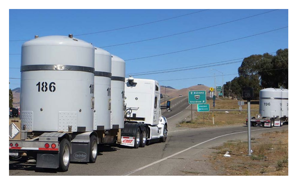
Transuranic Waste Shipment Departing Livermore on October 30, 2020