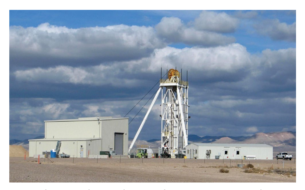
U1h Hoist at the Nevada National Security Site U1a Complex

improvements for the hoist systems at the U1a Complex. The Board's staff plans to review the evaluation and determine whether NNSA addresses the Board's concerns.