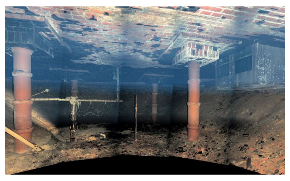
216-Z-9 Crib on June 8, 2007

In July 2020, DOE directed the contractor to stabilize three structurally weak, highly contaminated, underground structures (known as "cribs") located within the work control boundary of the Plutonium Finishing Plant to remove the possibility of a subsidence similar to the 2017 PUREX tunnel collapse. As of December 2020, one of the three underground structures had been partially stabilized. The contractor will complete stabilization of that structure and the other two underground structures before resuming retrieval of the remaining higher hazard debris. Project personnel are also demolishing unused mobile offices that were contaminated in 2017 as part of the broader clean-up mission at the Plutonium Finishing Plant. The Board continues to monitor closely ongoing stabilization and debris removal activities.