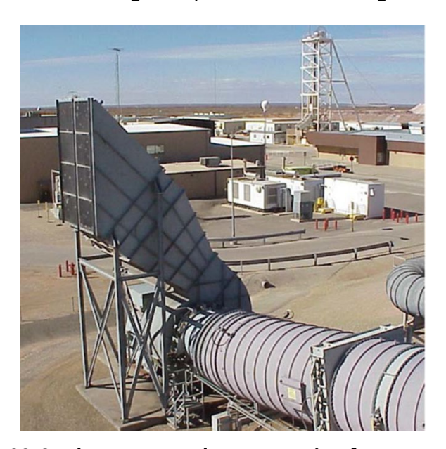
700-C Exhaust Fan under Preparation for Restart

The Board continued to provide oversight of Waste Isolation Pilot Plant operations, the National Transuranic Program, and construction projects intended to increase underground ventilation, including the Utility Shaft Project and the Safety Significant Confinement Ventilation System Project. These construction projects are discussed in detail in Section VI of this report. In the interim, Waste Isolation Pilot Plant management is preparing to bring the 700-C Fan, an unfiltered exhaust fan, back online under specific operating conditions to improve underground airflow. The Board has observed some improvements in the contractor self-assessed areas but identified the need to continue striving to improve federal oversight.