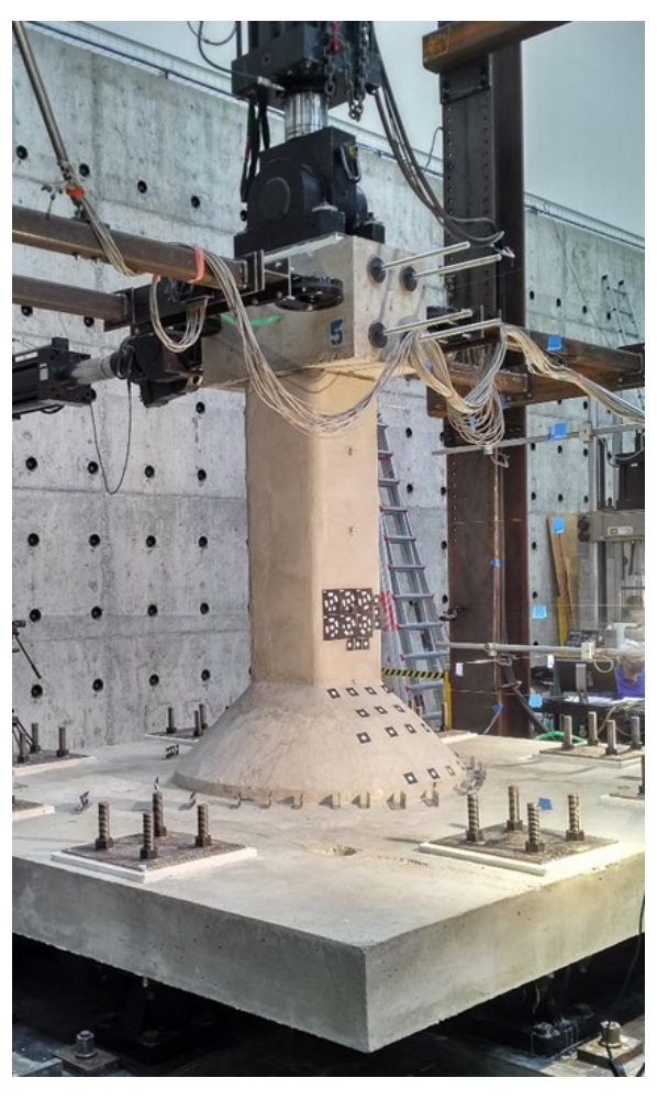
Plutonium Facility Column Capital Testing at the University of Nevada

Los Alamos National Laboratory is conducting a seismic performance reassessment project for the Plutonium Facility, Building 4, to address a seismic expert panel's prior recommendations. The goal of the project is to evaluate the performance of the facility's structure during an earthquake to ensure it can maintain confinement and remain operable. The Board's staff has followed the progress of the reassessment, attended workshops, and discussed its questions and comments with project personnel. The project team recently completed the first phase and is currently calculating an interim seismic risk for the facility.