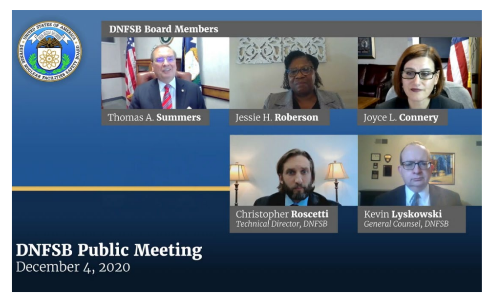
December 4, 2020, Virtual Public Meeting on Recommendation 2020-1

On June 11, 2020, DOE rejected most of the Board's recommendations for reasons related to the ongoing rulemaking for 10 CFR 830, rather than on substantive technical grounds. In the cases where DOE indicated that it partially accepted the Board's recommendations, DOE neither engaged with the Board's technical arguments nor made clear its proposed actions would address the Board's concerns. The Board sent a letter to DOE on September 25, 2020, expressing that it is well within the Board's jurisdiction to make recommendations related to DOE regulations, and that the Board expects DOE to accept or reject Board recommendations based on technical substance. The Board further noted that the Administrative Procedure Act and other laws do not prohibit a technical response to the Board Recommendation regarding 10 CFR 830.