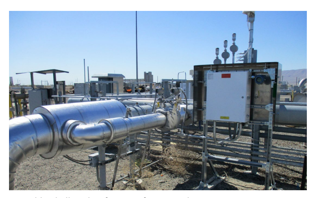
Double-Shell Tank Safety Significant Air Flow Monitoring Equipment

In 2020, the Board closed Recommendation 2012-2, Hanford Tank Farms Flammable Gas Safety Strategy . Recommendation 2012-2 identified the need for safety-related ventilation systems to aid in preventing flammable gas events in the double-shell tanks at the Hanford Tank Farms. The recommendation also identified the need to upgrade several other systems necessary to provide accurate and reliable indications of abnormal conditions associated with flammable gas events. For additional background on Recommendation 2012-2, see the associated entry in Appendix A of this report.