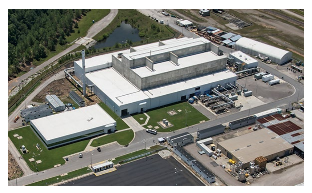
Salt Waste Processing Facility

The mission of the Salt Waste Processing Facility is to pretreat radioactive salt waste solutions from the F- and H-Area Tank Farms at the Savannah River Site. Pretreatment involves removing and concentrating selected actinides, strontium-90, and cesium-137 from the bulk salt waste solution and pumping them to the Defense Waste Processing Facility for vitrification. The remaining decontaminated salt solution is sent to the Saltstone Production Facility for immobilization in a grout mixture.