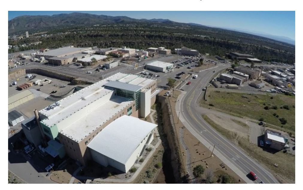
Radiological Laboratory Utility Office Building