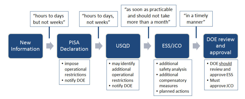
Board's Staff Illustration of Current DOE Guidance for Meeting 10 CFR 830 Requirements in Executing the Potential Inadequacy of the Safety Analysis Process<sup>2</sup>

On July 10, 2020, the Board provided the Secretary of Energy with results of its staff's review on the implementation of the Potential Inadequacy of the Safety Analysis process across the DOE complex. The Board's staff reviewed site Unreviewed Safety Question procedures, evaluated implementation data, and held discussions with DOE field offices and site contractors. The Board's staff found that site contractors inconsistently implement the Potential Inadequacy of the Safety Analysis process, particularly related to timeliness in declaring inadequacies and in executing follow-on Unreviewed Safety Question process steps. This is due to a lack of specific requirements and clear guidance on the Potential Inadequacy of the Safety Analysis process in DOE directives. The Board's staff also found that since DOE removed a requirement to report these potential inadequacies in DOE's occurrence reporting system in 2017, DOE has not established a formal mechanism for sites to notify DOE headquarters of these declarations. Such lack of notification will impede DOE headquarters' awareness and oversight of Potential Inadequacy of the Safety Analysis declarations and follow-on Unreviewed Safety Question determinations.