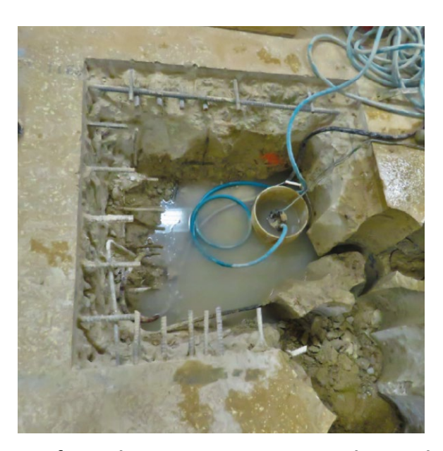
Construction for High-Pressure Fire Loop Lead-In Replacement

On August 6, 2020, the Board issued a letter to the Secretary of Energy delineating deficiencies in the identification and control of safety basis and quality assurance requirements for Pantex construction projects. The Board had previously identified deficient quality assurance for reinforced concrete construction during the replacement of the high-pressure fire loop leadins for the 12-98 cells at Pantex in 2016. The Pantex contractor subsequently determined the concrete placed during that work to be understrength, demolished it, and replaced it using appropriate quality assurance measures. In 2019–2020, the Board reviewed lead-in replacement for the 12-96 cell. The Board found improved quality assurance compared to the 12-98 lead-in replacement but observed that Pantex had not fully implemented the lessons learned from the 12-98 project, particularly related to identification and control of system requirements.