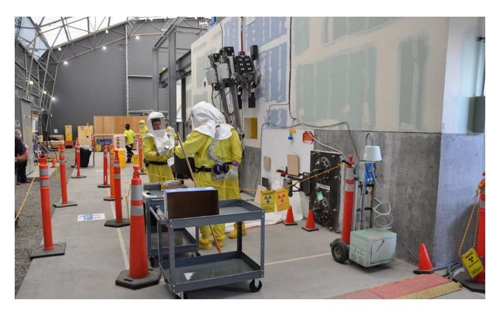
Mock-up Facility Configured for Building 324 High Contamination Area Training

contaminated areas remains paused while the contractor continues to implement other corrective actions. Work at the facility will move forward once the full suite of corrective actions is complete and after the execution of an ongoing contract transition.