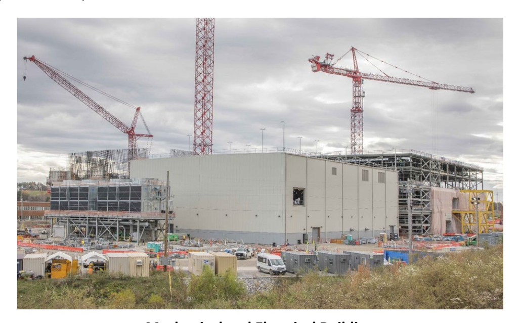
Mechanical and Electrical Building

The non-nuclear portion of the overall project is approximately 85 percent complete and significantly more advanced than the nuclear portion. The Main Processing Building and the Salvage and Accountability Building, which will process nuclear material, are slightly less than 50 percent complete.