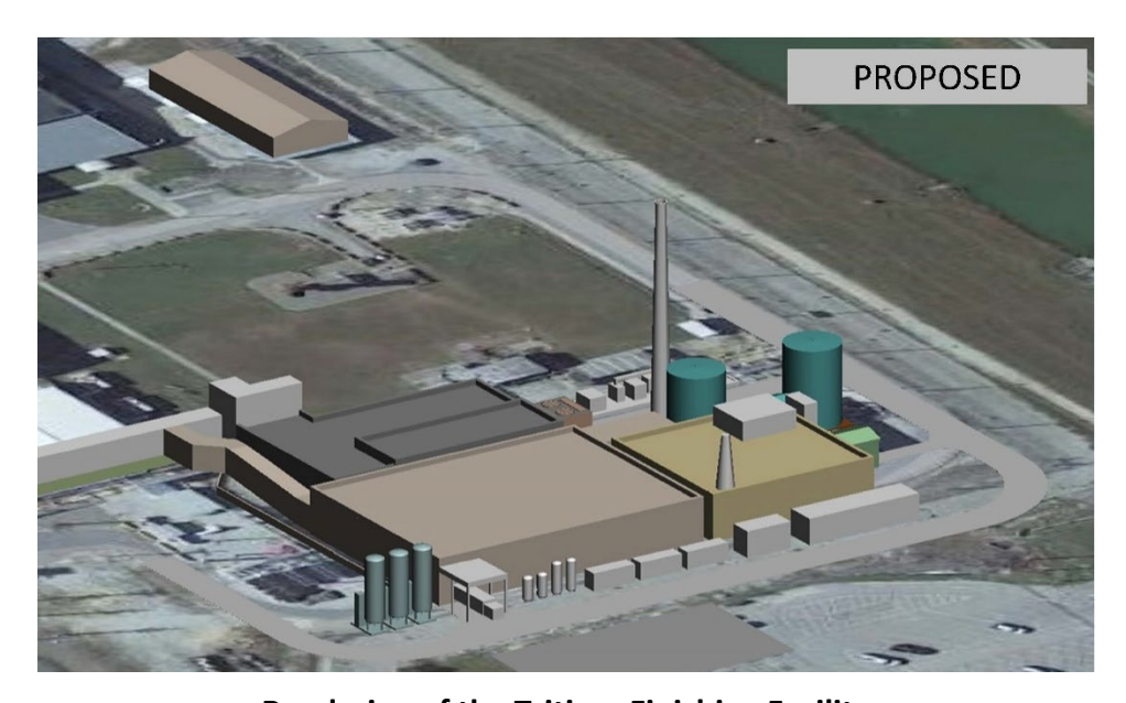
Rendering of the Tritium Finishing Facility

NNSA plans to construct the Tritium Finishing Facility at the Savannah River Site to replace key capabilities currently located in H-Area Old Manufacturing—a 1950s vintage building that does not fully comply with current industry codes and standards. The capabilities of the Tritium Finishing Facility will include reservoir acceptance, reservoir assessment, assembly, pre-loading, and packaging and shipment. In 2018, NNSA placed the project on hold due to funding constraints. In December 2019, NNSA approved Critical Decision-1 for the Tritium Finishing Facility, marking the completion of the project definition phase and the conceptual design. The Board notes that the Tritium Finishing Facility is currently not projected to begin operations until sometime between the fourth quarter of Fiscal Year 2029 and the fourth quarter of Fiscal Year 2031, and even then it will not replace the facilities that contain the largest fraction of readily dispersible tritium at the Savannah River Site.