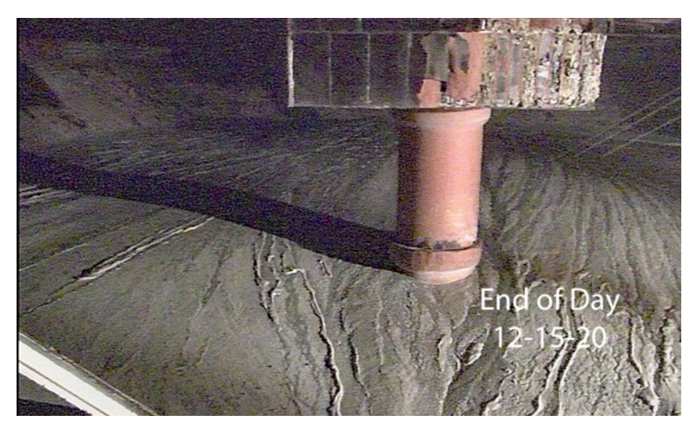
216-Z-9 Crib on December 15, 2020