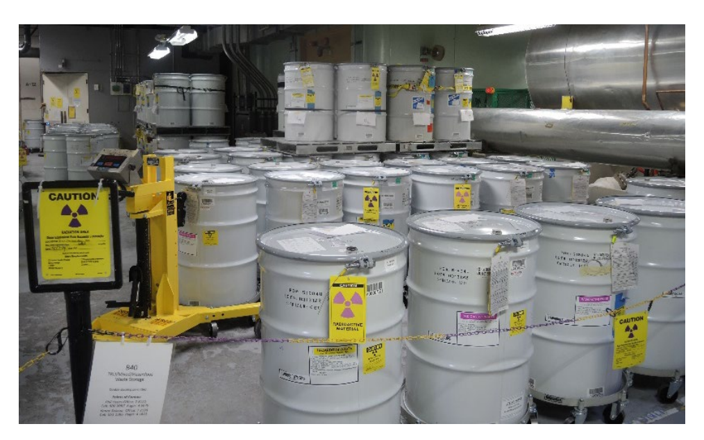
Transuranic Waste Containers Staged Inside the Plutonium Facility

clean-up operations at Los Alamos National Laboratory, as well as the Board's interface with DOE. This was the Board's first invitation to present to this advisory board, and based upon the positive reception, other presentations may follow.