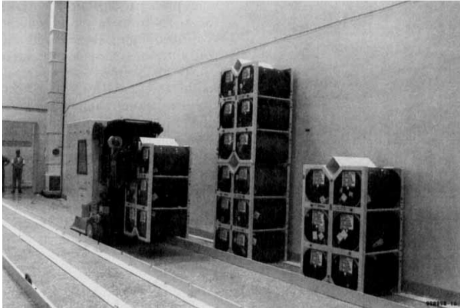
Figure 1. Initial loading of a room at Building 12-116 (late 1990s) with AL-R8 containers without sealed inserts in a “stage-right” configuration.

Pit Containers —The following containers are currently in use for pit staging at Pantex: the AL-R8 without sealed insert, AL-R8 Sealed Insert, and FL containers. Other approved pit containers, as described in Table 2.7.8-1, Nuclear Materials Container Summary , of the Sitewide SAR [9] and on the approved containers list of Section 5.7.9.1 of the TSRs [5], are not currently in use. 2 A brief description of pit containers currently in use at Pantex follows: