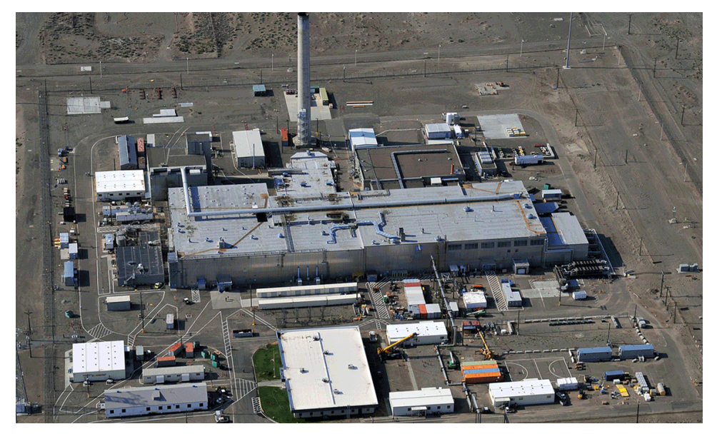
Figure 8. Plutonium Finishing Plant in 2016

Considering the contamination spread events observed in 2017, the Board continued to provide safety oversight of deactivation and decommissioning activities at the Plutonium Finishing Plant throughout 2021. Following the end of operations at the facility in 1989, it represented one of Hanford's most significant hazards with respect to the potential for radioactive material release. Demolition work at the facility began in 2016 and concluded in November 2021. Key metrics associated with Plutonium Finishing Plant's demolition are removal of more than 90 structures as well as disposal of more than 14,000 tons of waste, 232 gloveboxes and ventilation hoods, 35,800 linear feet of asbestos insulation, 1.5 miles of ventilation piping, and 8,900 feet of ventilation duct.