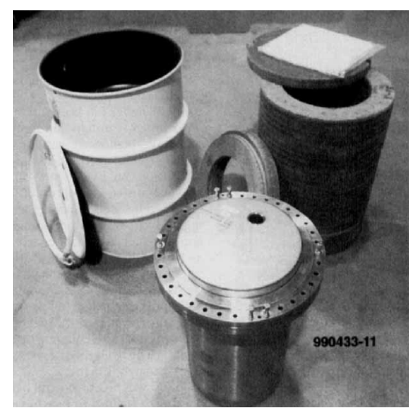
Figure 1. Pit Storage Container with Packing Material and Sealed Insert

From 2020 through 2021, the Board conducted a review of nuclear weapon pit staging at the Pantex Plant. More than two decades ago, the Board had issued Recommendation 1999-1, Safe Storage of Fissionable Material Called "Pits," which centered on the need to store pits in containers that would protect against degradation of the pits' corrosion-resistant cladding. In response to Recommendation 1999-1, DOE committed to repackaging pits into containers featuring a sealed insert filled with inert gas to protect the pit cladding. In closing Recommendation 1999-1 in 2005, DOE indicated it had completed repackaging almost all pits at Pantex into sealed insert containers. However, the Board's recent assessment found that the population of pits in storage containers without inner sealed inserts increased from 8 percent to 14 percent of the total inventory between 2014 and 2021, even as the total inventory of pits increased. Of note, the Board identified that pits from disassembly and dismantlement campaigns have accumulated in these unsealed containers.