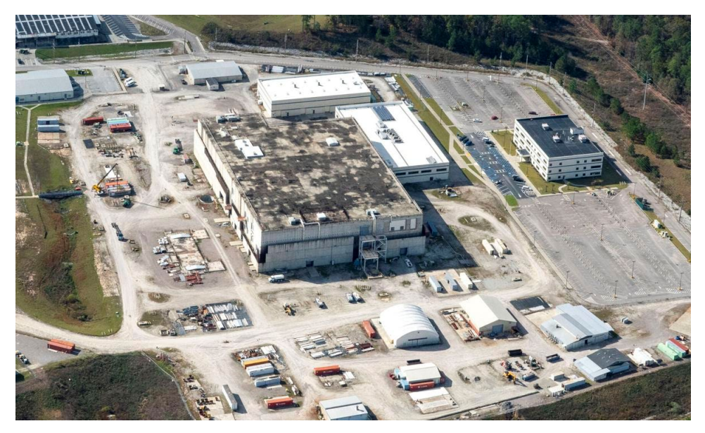
Figure 12. Savannah River Site Building 226-F

The 2018 Nuclear Posture Review recommended establishing "the enduring capability and capacity to produce plutonium pits at a rate of no fewer than 80 pits per year by 2030." NNSA plans to use the partially constructed Building 226-F located in F-Area of the Savannah River Site for a new plutonium pit production facility. Building 226-F was originally designed for the Mixed Oxide Fuel Fabrication Facility project, which is now canceled. NNSA is repurposing Building 226-F as the Savannah River Plutonium Processing Facility designed to produce 50 of the required plutonium pits per year. On June 25, 2021, the Deputy Secretary of Energy approved Critical Decision-1, Approve Alternative Selection and Cost Range , for the Savannah River Plutonium Processing Facility, marking the completion of the project definition phase and the conceptual design. NNSA stated in its Critical Decision-1 approval letter that it estimates project completion between fiscal years 2032 and 2035.