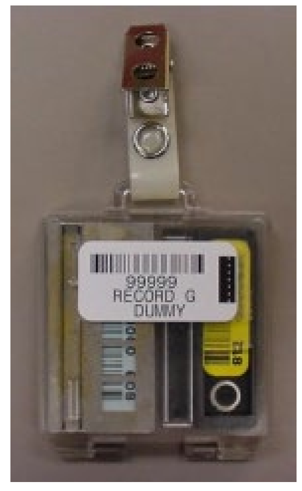
Figure 15. Thermoluminescent Dosimeter to Monitor External Radiation Dose

with the objective of identifying opportunities for improvement to help prevent similar problems at Pantex and throughout the DOE defense nuclear complex. During the review, the Board's staff identified that NNSA and its contractor did not recognize and respond to weaknesses in the external dosimetry program, including significant personnel turnover, aging equipment, lack of timely contract maintenance support, and the unavailability of replacement equipment. The Board's staff also identified lessons learned related to oversight by the NNSA Production Office. The Board's staff will complete its evaluation in 2022.