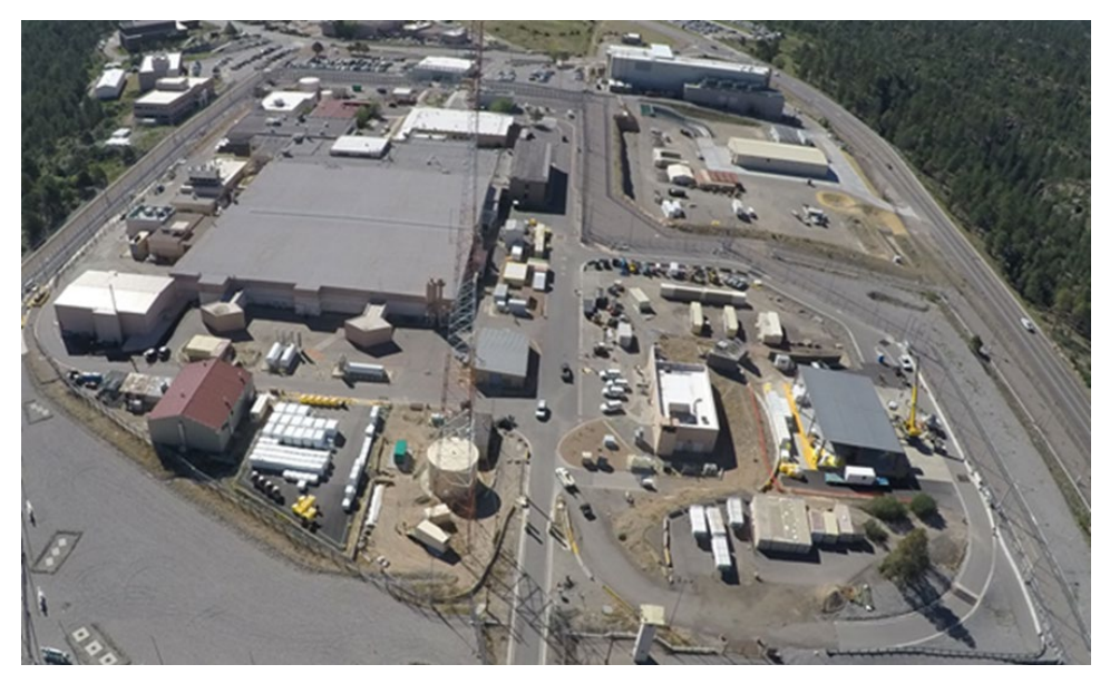
Figure 2. Los Alamos National Laboratory Plutonium Facility (on the left)