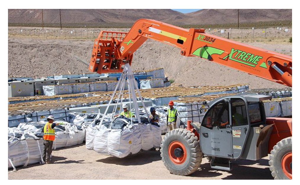
Figure 11. Low-Level Waste Disposal Activities at the Radioactive Waste Management Complex

On November 10, 2021, NNSA<sup>9</sup> responded to the Board's letter and provided the requested report. In the report, NNSA described corrective actions that the site contractor is implementing to improve the quality of safety basis documents, plans to update each facility's safety basis to modern directives, and plans to address the technical issues in the facility safety basis. NNSA plans to provide the companion briefing to the Board in early 2022.