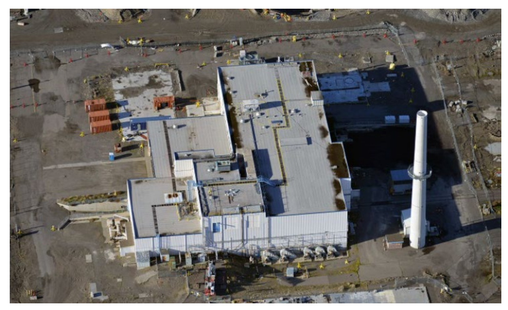
Figure 10. Building 324