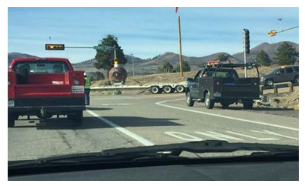
Figure 3. Rolling Roadblock During Onsite Transportation of Confinement Vessel at Los Alamos National Laboratory

On April 8, 2021, the NNSA Production Office and the Y-12 contractor briefed the Board on the requested topics. NNSA Production Office leadership noted its higher expectations for depth and frequency of safety oversight, pushing for continuous improvements in the nuclear criticality safety program, and building on lessons learned. NNSA Production Office leadership also stated that the Y-12 nuclear criticality safety program is being implemented in a manner that ensures safe operations and is improving. The Board remains concerned that, notwithstanding its engagement with site leadership, there have been continued operational safety incidents at Y-12, including events in which ineffective communication among the contractor's organizational elements played an important role. The Board is continuing to monitor the sustainability and effectiveness of improvement actions by the NNSA Production Office and the Y-12 contractor.