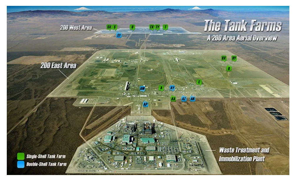
Figure 7. Hanford Tank Farms Aerial Overview

The single shell tanks are beyond their useful life, and despite previous stabilization efforts, which removed most liquids from the tanks, some of the single-shell tanks are leaking liquid waste to the environment. This year, the B-109 tank became the latest single-shell tank to be classified as an assumed leaking tank with an active leak. Between 1968 and 1986, DOE built the double-shell tanks that are used on the site. The aging single-shell tanks were subsequently stabilized by transferring all pumpable liquids to the double-shell tanks. Retrieval of the sludge and saltcake that remained behind in the single-shell tanks involves mobilizing the waste by using pressurized water directed through robotic sluicing equipment, then pumping the slurry to a double-shell tank for safe storage.