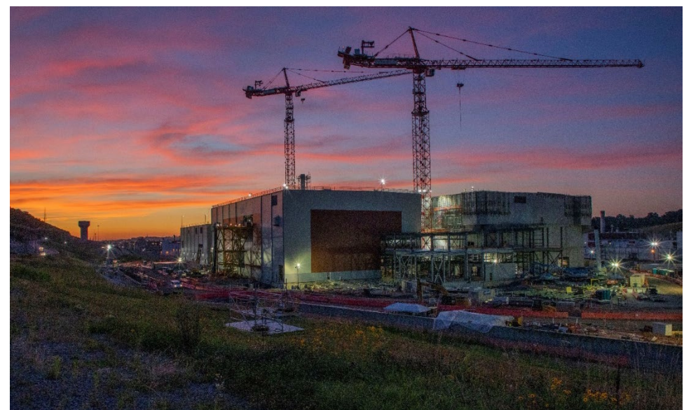
Figure 14. Uranium Processing Facility Construction