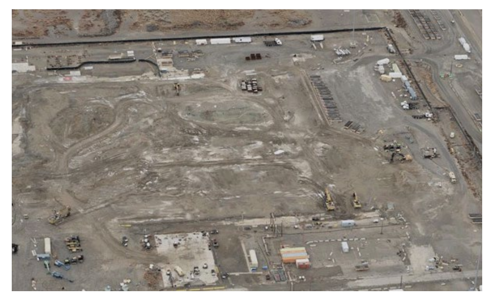
Figure 9. Plutonium Finishing Plant in 2021