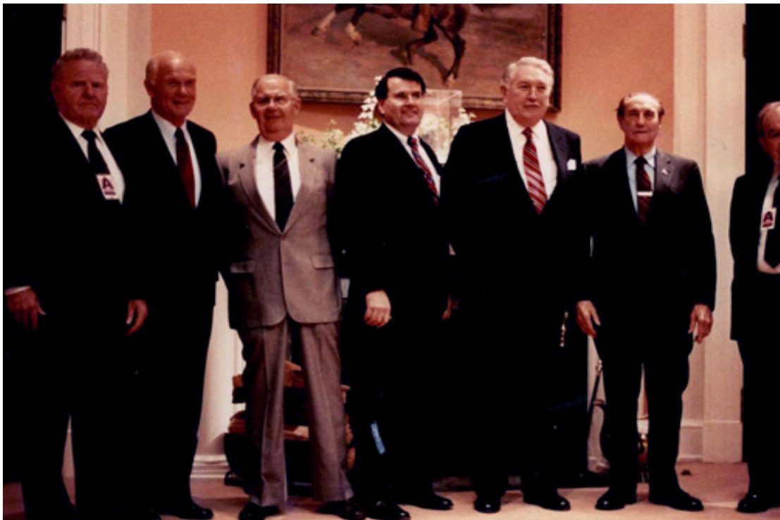
Senators John Glenn (2 nd from left) and Strom Thurmond (2 nd from right) with Board Members at the White House oath of office ceremony – October 25, 1989.