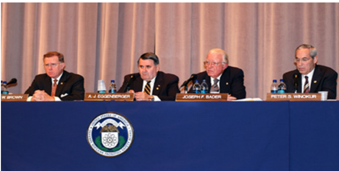
DNFSB Board Members conducting a public meeting and hearing in Los Alamos, New Mexico to assess the current safety posture at Los Alamos National Laboratory – December 5, 2007.