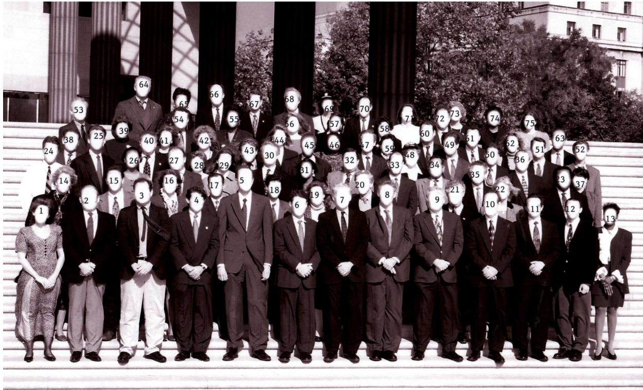
For key to staff photo, see numbered list below.