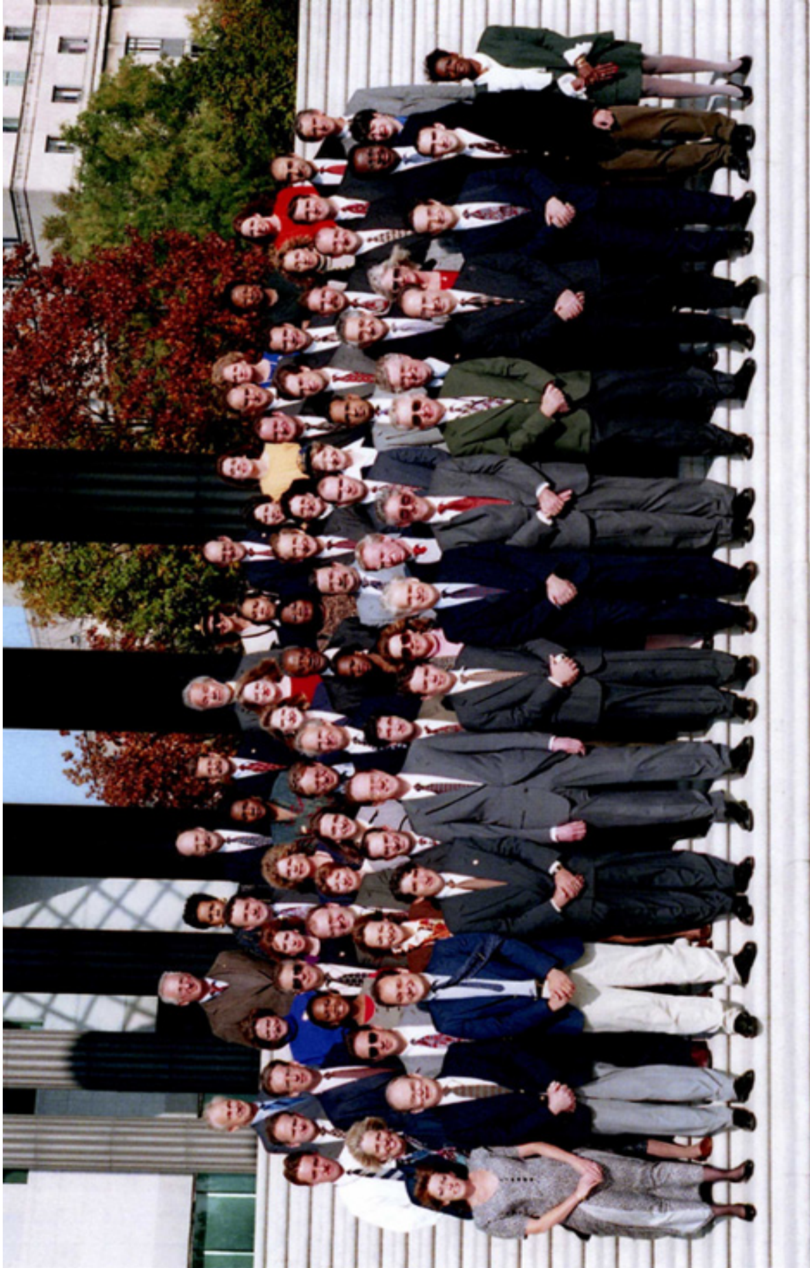
Board Staff on the steps of the Canadian Embassy - November 1996